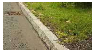
Rough-faced conservation kerbing will mellow faster than the smooth concrete of a standard kerb