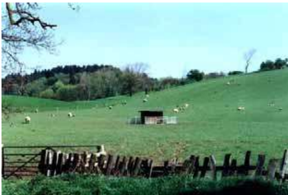
A character random height paling fence forming the boundary to Bordesley Deer Park against a backdrop of hills and woodland

The land of the Parish was given to the church by Offa, King of Mercia and Overlord of England in 780 AD. It broadly occupies the basin of the River Arrow headwaters. In the twelfth century the Bishop of Worcester selected Alvechurch to enclose a deer park, building a summer palace, fishponds and gardens within it. This is now considered to be a very good example of the recently-recognised concept of “a medieval aesthetically-modified landscape”. The boundaries are still visible as ditches and banks around the major part of its periphery.