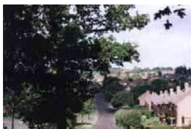
Homes set on slopes benefit from views of the surrounding landscape

Bear Hill. Properties set on the hillside form a major feature and add to the pleasant randomly evolved nature identified during the Alvechurch Character Workshop. Other developments within the valley have a more suburban character but all benefit from views of the adjacent hills and the rich planting of native mature trees and hedgerows forming wild life corridors.