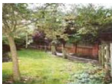
The character of the network of walks linking different parts of the village, with its associated trees and hedges, should be maintained.