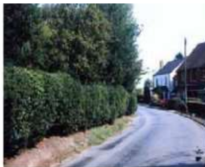
Holly trees and hawthorn hedges, allowed to grow to large scale - the houses behind them are set back substantially from the road