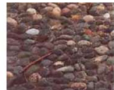
Victorian paving bricks, conservation kerbing, grey or brindle “drivesett” blocks, stone setts, cobbles and tarmac are preferred materials than that of modern day block-paving