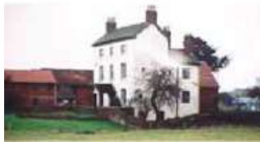
This three-storey farmhouse is a local feature common also to other parts of The Parish