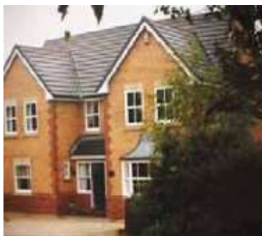
Retention and additional planting of native species of hedgerow and trees can help soften new properties