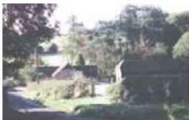
The traditional design of recently constructed stables blends into the mature landscape