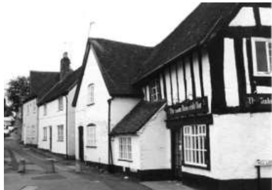
Medieval houses in Alvechurch survive to this day

By the end of the thirteenth century the borough was thriving. The population then suffered badly from the Black Death plague and subsequently economic activity was restricted, becoming largely agricultural when the bishops ceased to use the Palace.