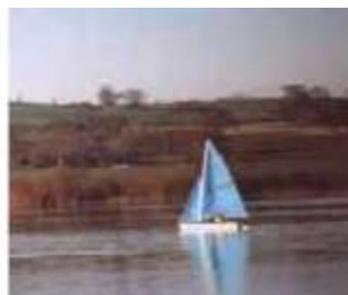
Bittell Lakes create opportunities for sailing and fishing