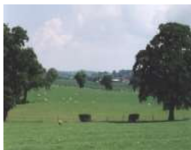
Many homes enjoy interrupted views across farmland to the rear.

Extensive views of the surrounding hills and open farmland are Bordesley's most significant landscape feature.