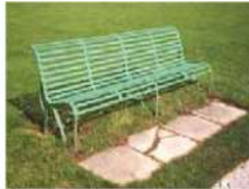
Good design public seating in a non-manicured setting