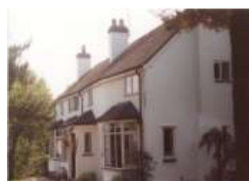
When altering or renovating old properties, the use of traditional materials and roof angles and other detailing helps retain original character