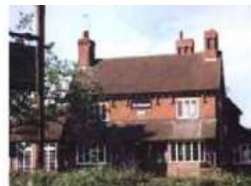
The Parish is well provided with country pubs