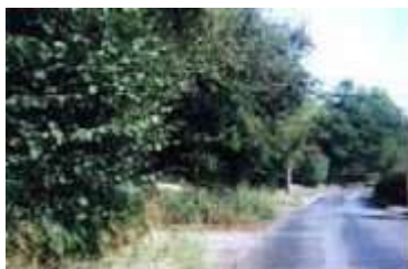
The spaciousness within the development, including mature native trees and hedges, forms a major part of Rowney Green’s rural character