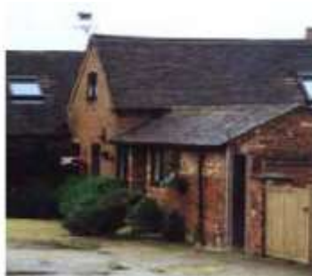
Sympathetic barn conversions also form part of the Seecham Area character.