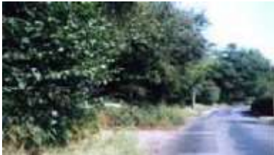
The retention of a patchwork of material and informal grass edges associated with footpaths and highways is to be encouraged