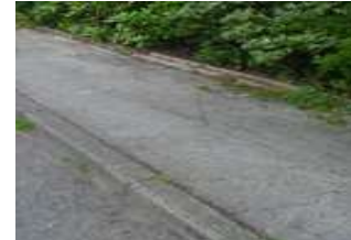
Recycled kerbing materials have a mellow appearance whilst remaining functional