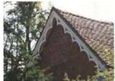
Decorative barge boards on gable ends and local Alvechurch-character red brick