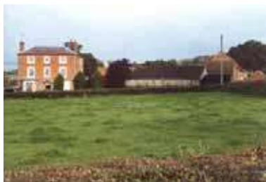
Working farms, a welcome sight along the back lanes of Hopwood, are to be encouraged in their efforts to protect the environment

The M42 Motorway crosses Hopwood in an east-west direction and separates the hamlet from the rest of the Parish.