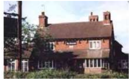
The Peacock is a "country pub" within one mile of the Birmingham City boundary

The Hopwood settlement is well served for recreation facilities. It has two pubs, a hotel, a village Hall, a community centre and playing fields, two rugby clubs, a cricket club, a sailing club, fishing lakes and canal. Part of the North Worcestershire Path runs through Hopwood.