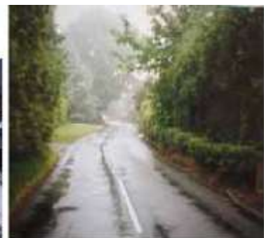
Residential development partly hidden behind mature native hedges and trees is a typical of Rowney Green character