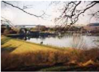
Canal feeder lakes provide opportunities for wildlife observation, fishing and boating in addition to enhancing views across a spacious, open landscape.