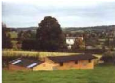
Stables, where possible, should be set down into the landscape or amongst trees