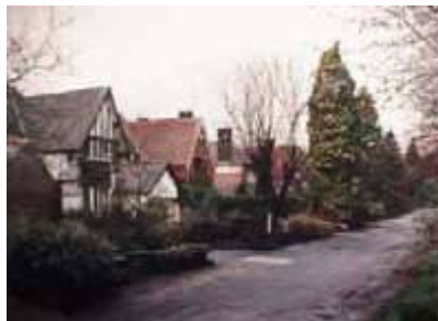
Where the ribbon development along the main road is set back on a service road, trees and hedgerow help to blend it in with its surroundings

The absence of kerbing, signage and street lighting is preferred. Should it be necessary for certain safety or functional reasons, it should be of a non-urban style.