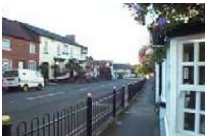
Roadside parking can be an advantageous means of traffic calming whilst contributing to passing trade for shops