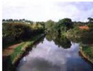
The canal forming part of the Alvechurch Village boundary is a valuable cycle way and footpath leading in and out of the area