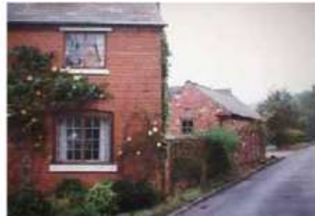
A recently-built garage, making good use of reclaimed bricks, slate roof and wooden window frames, to blend with the original cottage