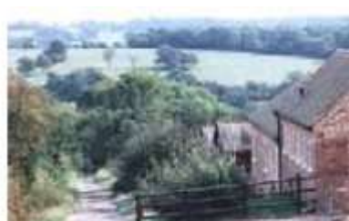
Unrestricted rural landscape views from Chapel Lane providing good walks and recreational amenity for villagers and visitors

The settlement, with each of its three sub-sections, is spread over approximately one square mile and situated about a mile south east of Alvechurch Village, separated by farmland, the Alvechurch bypass and the slopes of Newbourne Hill. Each of the three sub-sections has subtly different landscape character. To the northern side of Newbourne Hill, close to the motorway, lies Seecham agricultural and equine community. The ribbon development of Rowney Green lies on the Eastern side of Newbourne Hill and Lower Rowney Green lies in a small adjacent valley.