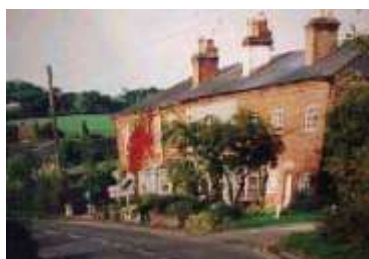
Low-density housing at the fringes of the village help it blend with the surrounding landscape