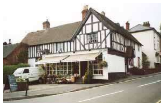
Shop fronts and their signs in keeping with the character of the buildings they occupy are to be encouraged

Much of the housing in the Conservation Area in the centre of Alvechurch is small character properties. Future changes to the village must meet the needs of a changing society through consideration and regard to this Design Statement and the WCC Alvechurch Historic Environment Resource Assessment.