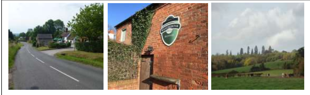
Coach and Horses public house, has a traditional walk-in entrance from the road. It has been extended but the “original pub” character has been cleverly retained