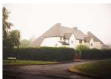
Rowney Green, like other hamlets within the Parish, has a small development of well-designed houses, originally council-owned