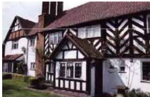
A local landmark, this listed property has had a recent porch addition in keeping with the original building's character