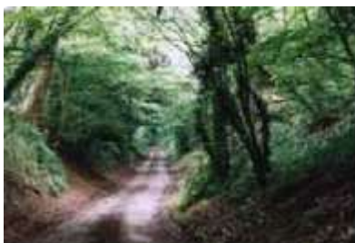
Quiet lanes provide the ideal setting for walking, cycling and horse riding