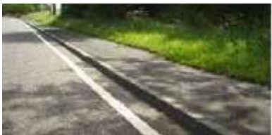
Stone setts must be retained and encouraged for use in new schemes where possible