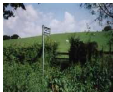
Access to the open countryside is limited to one public footpath