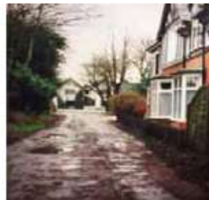
A quiet unsurfaced, access lane off the main A441 makes a welcome contrast to the noise and busyness of the adjacent road