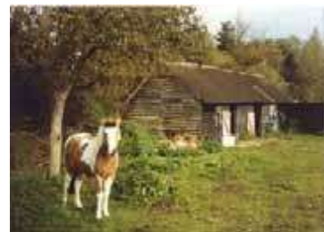
The Parish has many pony paddocks with associated stables –some well-disguised

Open farmland and informal green space including woodland and spinneys between Alvechurch and its surrounding hamlets, particularly on the Rowney Green and Weatheroak side; contribute importantly to the area's rural character and recreational quality. This factor was expressed with enthusiasm at each of the Character Workshops.