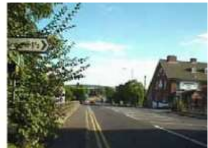
The A441 Birmingham to Redditch Road carries a large amount of traffic, connecting South Birmingham with the M42