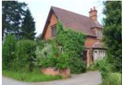
Steep roof angles, windows with leaded lights, ornate chimneys, stone architraves all practical to build with today's materials