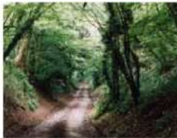
Icknield Street is a single track low traffic usage lane providing a good recreational opportunity for walkers, horse riders and cyclists