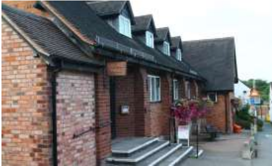
Alvechurch Village Hall

Refer also to Features Common throughout Parish – P5