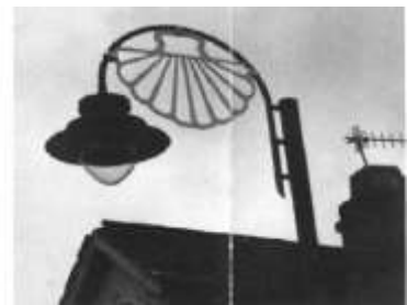
Should lamp standards need to be replaced, heritage-type designs are preferred or good quality equivalent