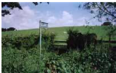
Footpaths across open farmland link each area of the Parish