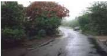
Setting kerbing height below 80mm will improve its appearance