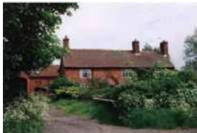
Informal boundaries created by hedges and loose stone driveways without kerbing