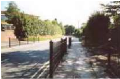
Hoop- top fencing introduced into a part of the village previously devoid of “conservation” street furniture