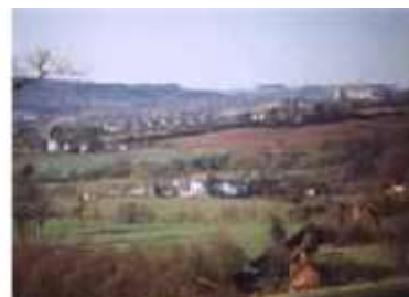
The majority of Hopwood settlement sits on the side of a hill, from the top of which there are impressive views over large areas of open countryside