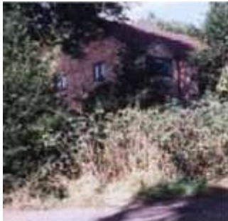
A, recently built, traditional design cottage. Retention of the mature hedge is good practice

Refer also to Features Common throughout Parish – P9