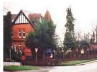
A number of large houses have been preserved by conversion to residential care and nursing homes