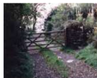
The adjacency of the countryside and footpath access to agricultural land is important.

Much of the housing in the Conservation Area in the centre of Alvechurch is small character properties. Future changes to the village must meet the needs of a changing society through consideration and regard to this Design Statement and the WCC Alvechurch Historic Environment Resource Assessment.