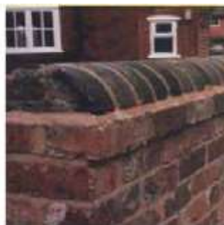
Examples of recent building additions in keeping with original character