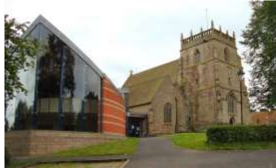
St Laurence Church