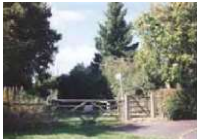
Access to footpaths and bridle paths from within the village ensures that all residents and visitors can enjoy the benefit of the landscape and farmland