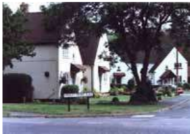
Smedley Crooke Place; A well designed small development and associated planting

Some of the older houses along the A441 were built end-on to the road, so that their front and back faced north and south.