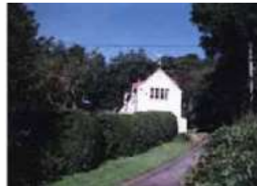
Pretty country lanes without through traffic are ideal for walking and horse riding

With no shop, nor pub, The Village Hall (formerly called The Peace Memorial Hall) provides a focal point for village social life with a “one day” pub “The Goat and Trousers” being held there on Friday evenings.