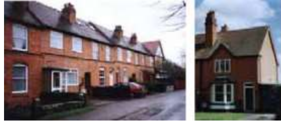
Red brick terraced cottages at Hopwood

During the course of development of The Parish over the centuries, there have been local sources of timber, sand, gravel, sandstone and clay. These materials influenced building design, colour and character