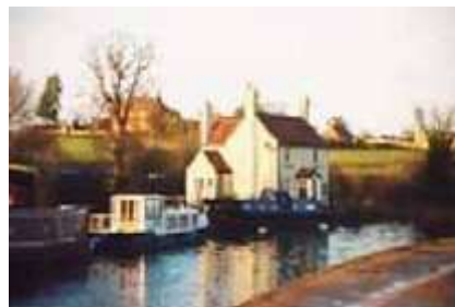
On the canal, commercial transport has given way to recreational use, generating local employment