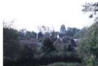
The shopping precinct sits within mature trees when viewed from The Meadows recreation area