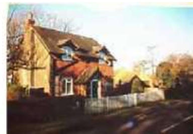
Overhanging eaves, inset dormer windows and decorative gable ends, are a local characteristic