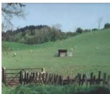
A relic of Bordesley Park Boundary, this random-paling stock fence illustrates hand-made rural character which could be replicated with today's rustic fencing materials