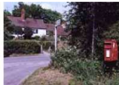
The wall-mounted post box opposite the Coach and Horses pub at the Icknield Street crossroads is a strong man-made landmark.