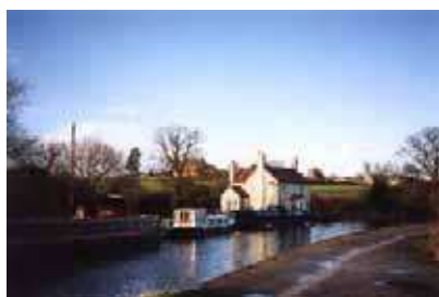
The use of the canal should be encouraged; it forms a natural boundary but is also a recreational amenity and a contributor to the commercial economy.

Despite the urban-style development, which has taken place in blocks between 1950 and the present, many parts of the village retain a rural character and there is a strong community spirit, often fostered by rural activity.