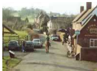
Horses being ridden along lanes and bridle paths are a common sight