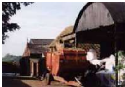
Active conventional dairy and sheep farming, complete with farmyard smells, adds true rural character to the settlement, close to the public house