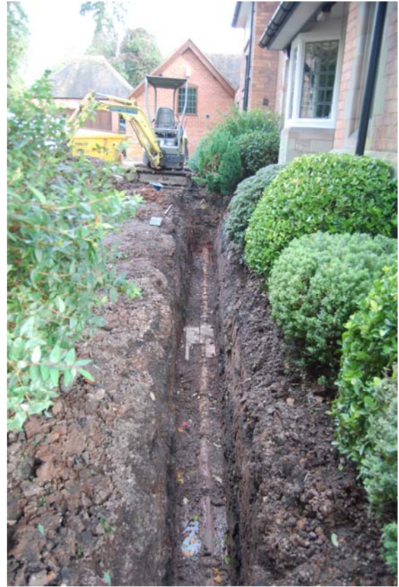
Fig 4 Trench looking north-east (detail)