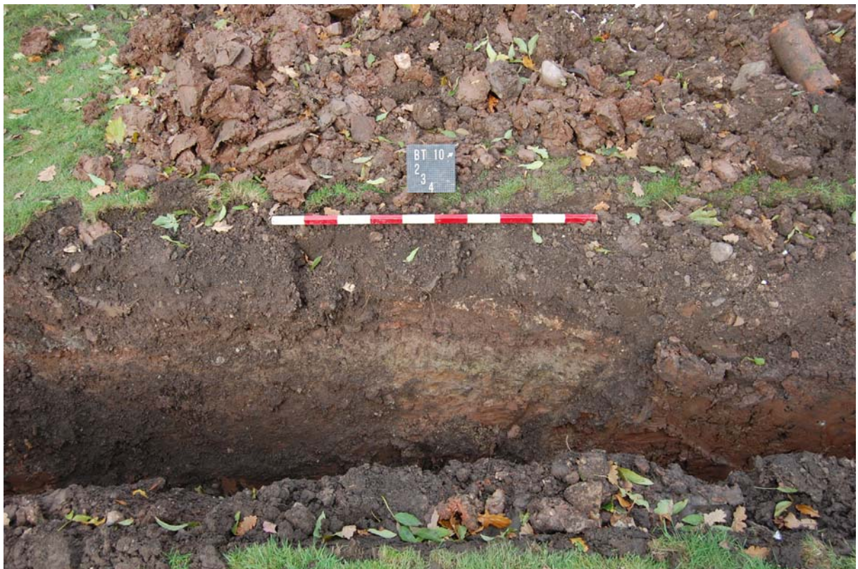
Fig 5 New manhole area looking north-east, layers 1-4