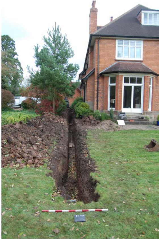
Fig 3 Trench looking north-east