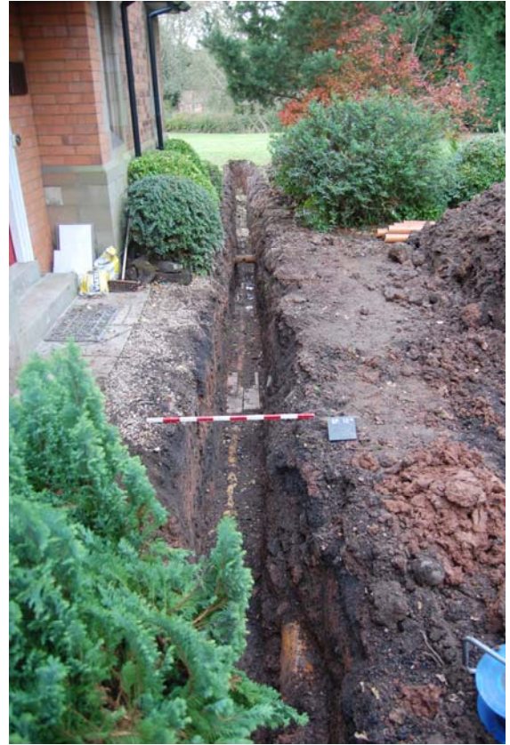
Fig 7 Trench looking south-west