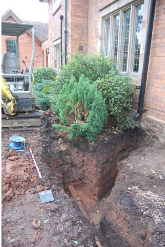
Fig 6 Dog-leg trench looking north-east