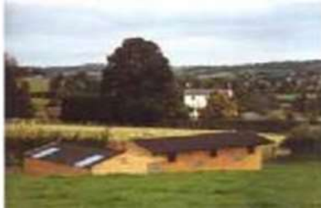
Stables, where possible, should be set down into the landscape or amongst trees