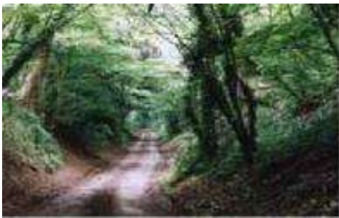
Quiet lanes provide the ideal setting for walking, cycling and horse riding