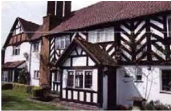
A local landmark, this listed property has had a recent porch addition in keeping with the original building's character