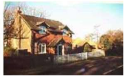
Overhanging eaves, inset dormer windows and decorative gable ends, are a local characteristic