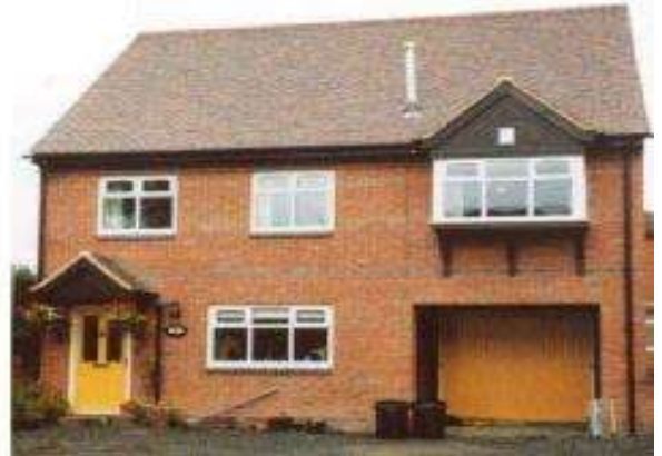
New buildings in local brick colour are in keeping