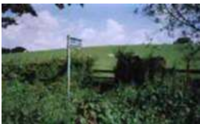
Footpaths across open farmland link each area of the Parish