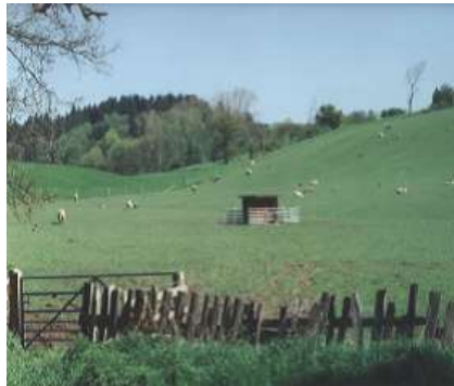
A relic of Bordesley Park Boundary, this random-paling stock fence illustrates hand-made rural character which could be replicated with today's rustic fencing materials