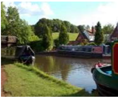
The canal moorings