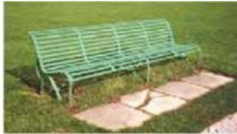
Good design public seating in a non-manicured setting