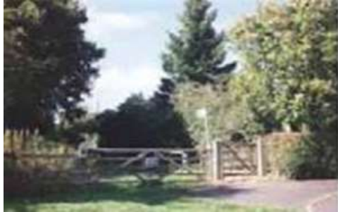
Access to footpaths and bridle paths from within the village ensures that all residents and visitors can enjoy the benefit of the landscape and farmland