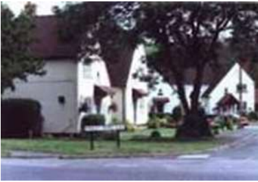
Smedley Crooke Place; A well designed small development and associated planting

Most of the properties in Hopwood were built pre-1950 apart from; the recently built 2010 Woodpecker Close, a mobile home park and the rest of recent building work confined to barn conversions. It has neither church, nor school, but instead, a Village Hall and Community Centre are a focus for community use. Some of the older houses along the A441 were built end-on to the road, so that their front and back faced north and south