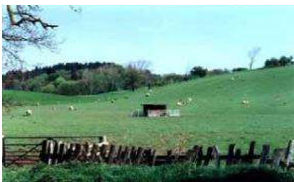
A character random height paling fence forming the boundary to Bordesley Deer Park against a backdrop of hills and woodland

By the end of the thirteenth century the borough was thriving. The population then suffered badly from the Black Death plague and subsequently economic activity was restricted, becoming largely agricultural when the bishops ceased to use the Palace.