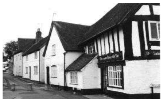
Medieval houses in Alvechurch survive to this day