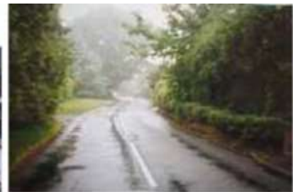
Residential development partly hidden behind mature native hedges and trees is a typical of Rowney Green character