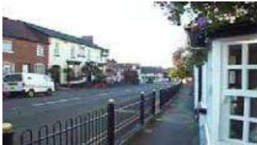
Roadside parking can be an advantageous means of traffic calming whilst contributing to passing trade for shops