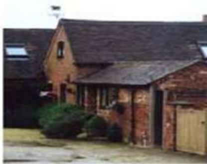
Sympathetic barn conversions also form part of the Seecham Area character.