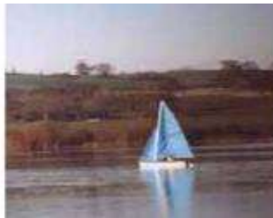
Bittell Lakes create opportunities for sailing and fishing