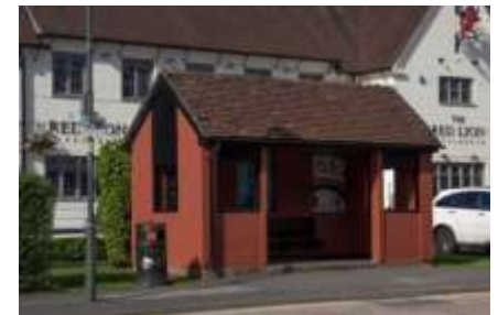
Bus stop o/s The Red Lion