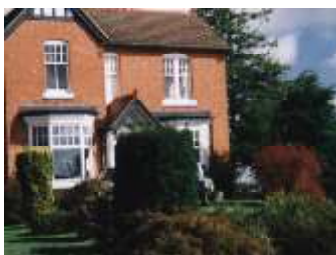
Buildings, set within a spacious plot have room for substantial adjacent planting helping blend them into their rural surroundings