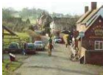
Horses being ridden along lanes and bridle paths are a common sight