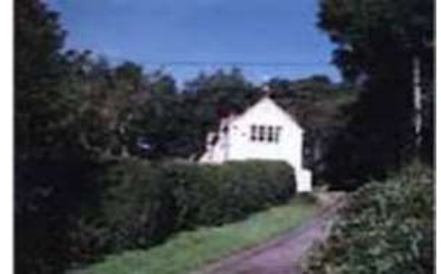
Pretty country lanes without through traffic are ideal for walking and horse riding

With a population of approximately 520 a good community spirit is promoted by societies and individuals using the village hall which is maintained and run by a volunteer committee of local residents. With no shop, nor pub, The Village Hall (formerly called The Peace Memorial Hall) provides a focal point for village social life with a “one day” pub “The Goat and Trousers” being held there on Friday evenings and a coffee/tea shop on Monday mornings.