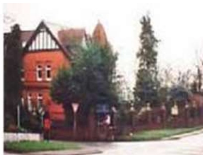
large houses used for care homes