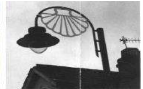
Should lamp standards need to be replaced, heritage-type designs are preferred or good quality equivalent