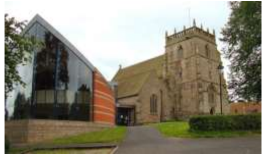
St Laurence Church

Over many years Alvechurch has enjoyed the benefit of its Village hall, its Baptist Church, Catholic Church and Church of England St Laurence and the shared church in Rowney Green