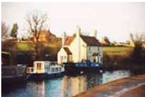
Commercial transport has given way to recreational uses

The M42 Motorway crosses Hopwood in an east-west direction and separates the hamlet from the rest of the Parish.