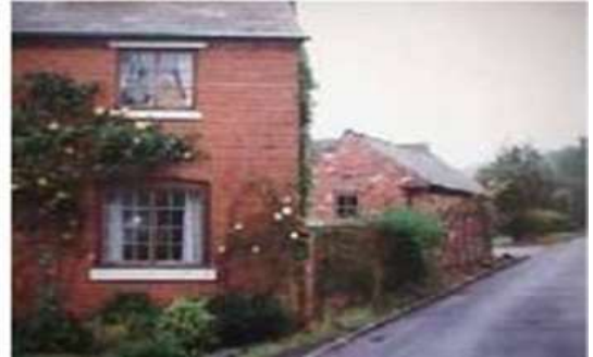
A recently-built garage, making good use of reclaimed bricks, slate roof and wooden window frames, to blend with the original cottage