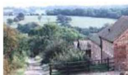
Unrestricted rural landscape views from Chapel Lane providing good walks and recreational amenity for villaagers and visitors