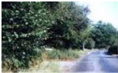
The spaciousness within the development, including mature native trees and hedges, forms a major part of Rowney Green's rural character

Originally comprising cottages built on The Bishop of Worcester's land during 17th and 18th centuries, this compact community identifies to this day with its "unspoilt"; quiet "hidden valley" and smallholding agriculture of the past.