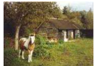
The Parish has many pony paddocks with associated stables, some well-disguised