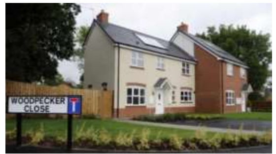
Affordable housing in Hopwood