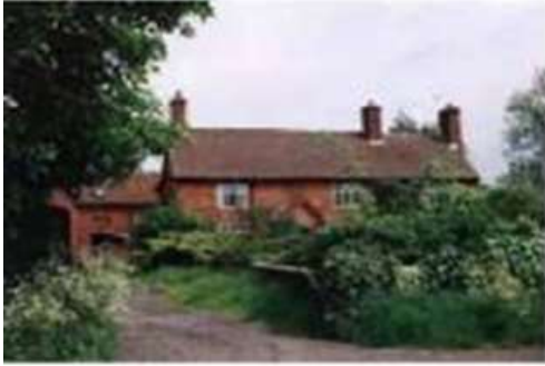
Informal boundaries created by hedges and loose stone driveways without kerbing