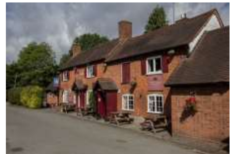
Withybed lane passing the Crown

The compact and unspoilt hamlet of Withybed Green with a population of approximately 100, contributes greatly to Parish recreation, via its access to footpaths across farmland. The country pub", The Crown Inn provides a focus for the community as well as food and drink for locals and visitors alike.