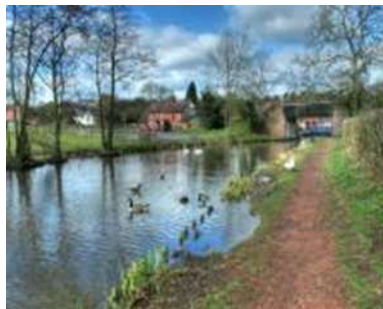
Near the Crown public house