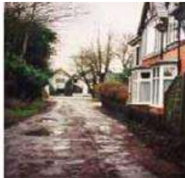
A quiet unsurfaced, access lane off the main A441 makes a welcome contrast to the noise and busyness of the adjacent road