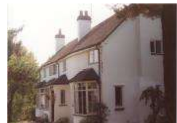
When altering or renovating old properties, the use of traditional materials and roof angles and other detailing helps retain original character