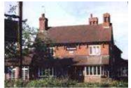
The Parish is well provided with country pubs