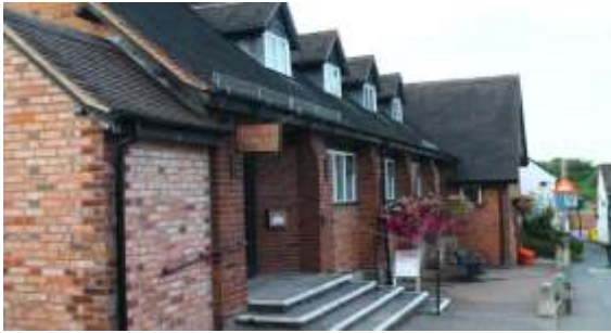
Alvechurch Village Hall