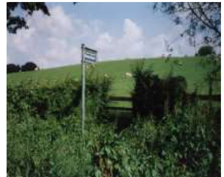
Access to the open countryside is limited to one public footpath