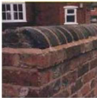
Examples of recent building additions in keeping with original character