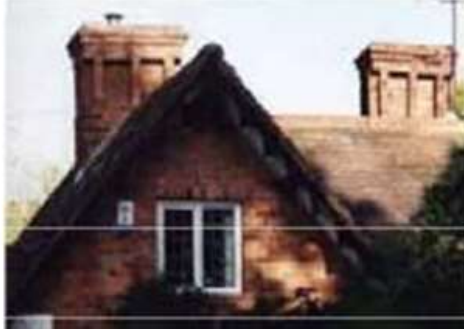
Steep roof angles, windows with leaded lights, ornate chimneys, stone architraves all practical to build with today's materials