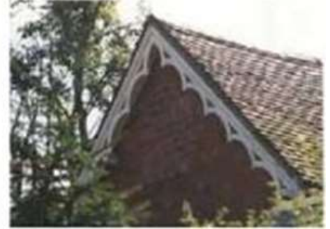
Decorative barge boards on gable ends and local Alvechurch-character red brick