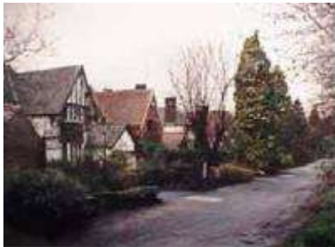
Where the ribbon development along the main road is set back on a service road, trees and hedgerow help to blend it in with its surroundings

The absence of kerbing, signage and street lighting is preferred. Should it be necessary for certain safety or functional reasons, it should be of a non-urban style.