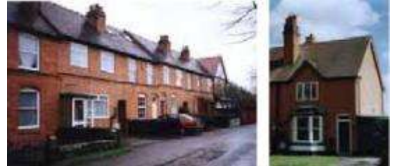
Alvechurch Red brick terraced cottages at Hopwood

During the course of development of The Parish over the centuries, there have been local sources of timber, sand, gravel, sandstone and clay. These materials influenced building design, colour and character