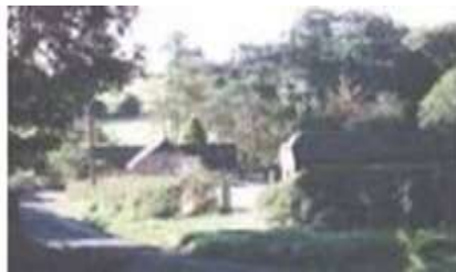
The traditional design of recently constructed stables blends into the mature landscape