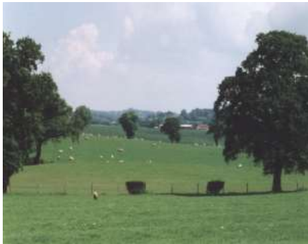
Many homes enjoy interrupted views across farmland to the rear.

Extensive views of the surrounding hills and open farmland are Bordesley's most significant landscape feature