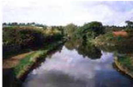
The canal forming part of the Alvechurch Village boundary is a valuable cycle way and footpath leading in and out of the area