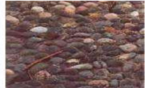
Victorian paving bricks, conservation kerbing, grey or brindle “drivesett” blocks, stone setts, cobbles and tarmac are preferred materials than that of modern day block-paving