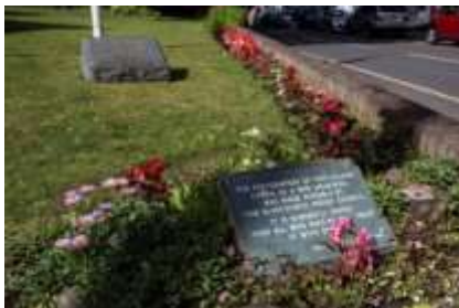
Road side planting highlights feature