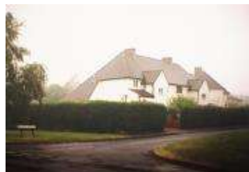
Rowney Green, like other hamlets within the Parish, has a small development of well-designed houses, originally council-owned