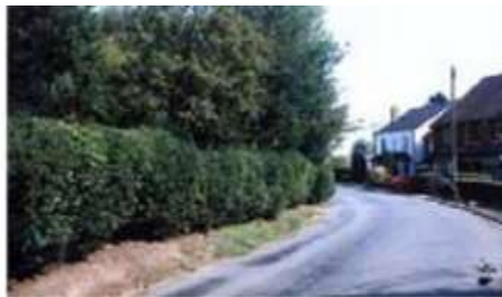
Holly trees and hawthorn hedges, allowed to grow to large scale - the houses behind them are set back substantially from the road