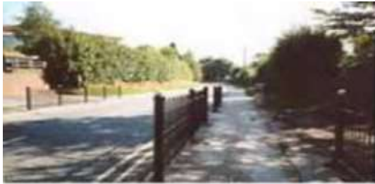
Hoop- top fencing introduced into a part of the village previously devoid of “conservation” street furniture