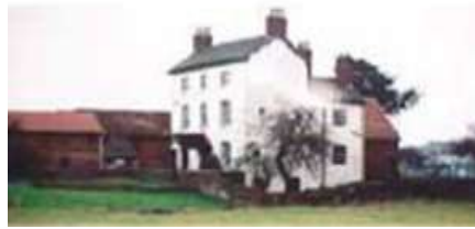
This three-storey farmhouse is a local feature common also to other parts of The Parish