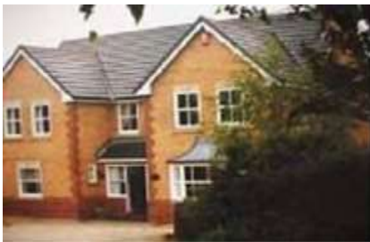
Retention and additional planting of native species of hedgerow and trees can help soften new properties