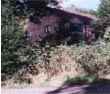
A recently built, traditional design cottage. Retention of the mature hedge is good practice