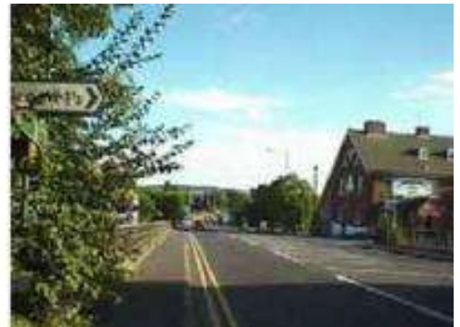
The A441 Birmingham to Redditch Road carries a large amount of traffic, connecting South Birmingham with the M42